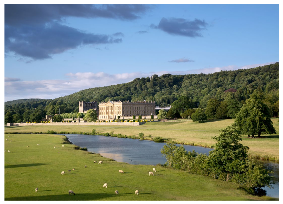
View of Chatsworth across the water

Lancelot 'Capability' Brown redesigned the landscape at Chatsworth in Derbyshire for the 4th Duke of Devonshire (1720-1764) from the late 1750s until 1765. The park covers 1000 acres and is enclosed by a 15 km long dry stone wall and deer fence. Brown's work at Chatsworth came relatively early in his career as an independent landscape architect, at a time when his style was becoming established.