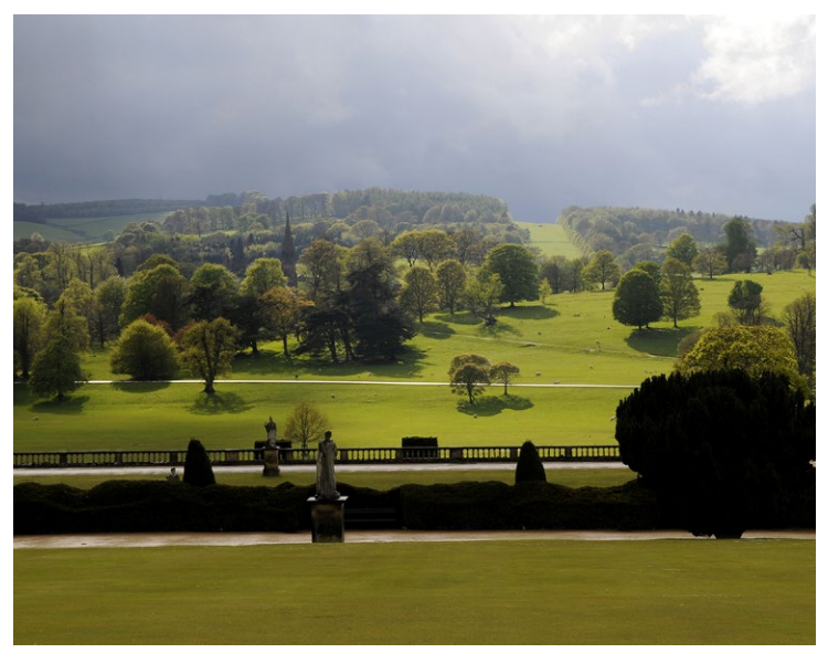
Chatsworth Park from the garden

Chatsworth Old Park Special Site of Scientific Interest (SSSI) within the site is important for its diverse range of deadwood invertebrates and lichens dependent upon the large number of ancient trees, mostly oak, formerly part of the medieval deer park. Nationally rare species include the rove beetle, silken fungus beetle and cobweb beetle and the dry acid grassland supports plants such as heath bedstraw and tormentil. The site also includes Jumble Coppice SSSI designated for its geological significance.