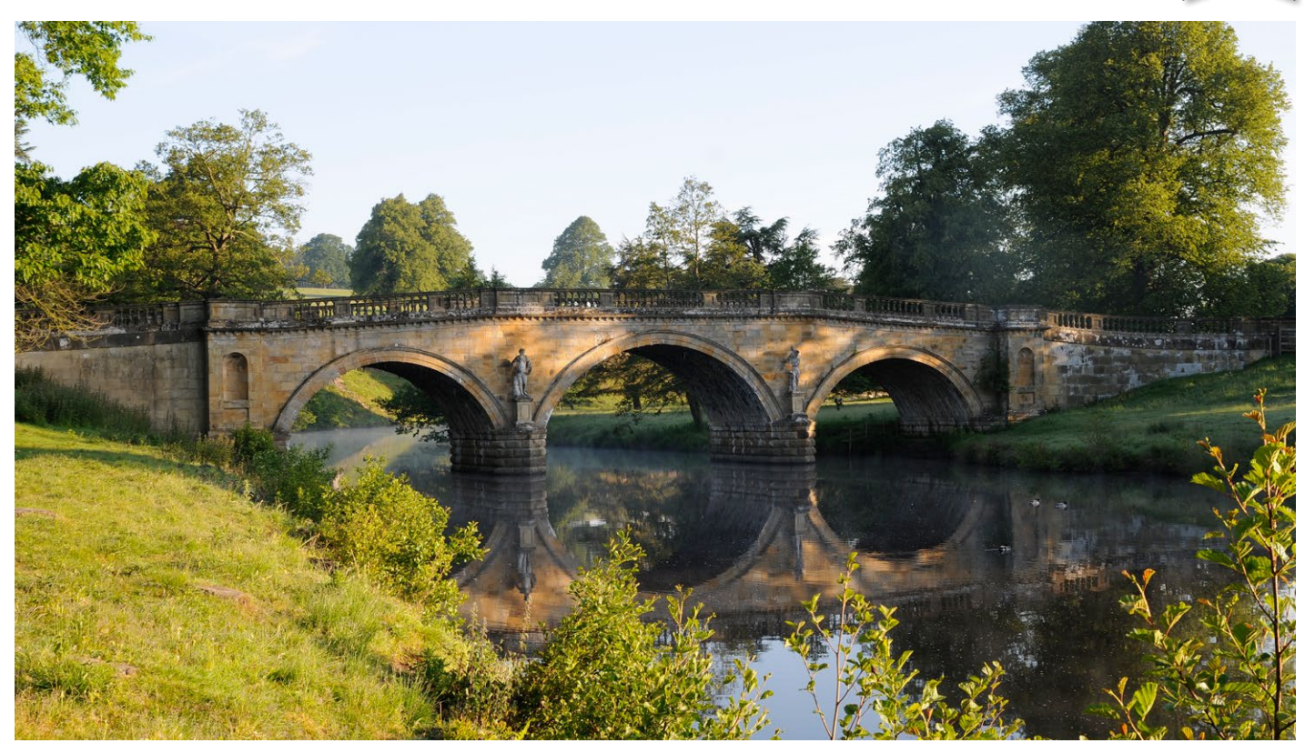
Paine's bridge over the River Derwent

A painting by Jan Siberechts of 1707, which can be seen at Chatsworth, shows the landscape as it was before Brown's work. There were lavish walled formal gardens immediately around the house, but the landscape outside the walls was rough and bare. The steep sides of the River Derwent meant that it couldn't be seen from the house.